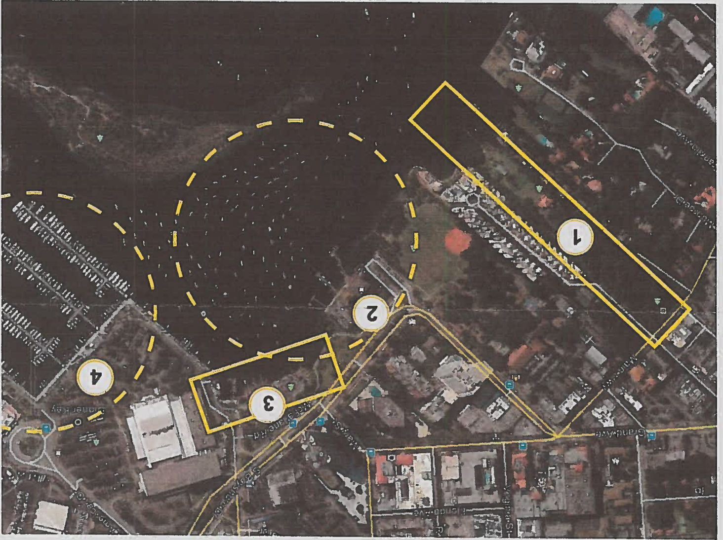
The Barnacle Historic State Park and Coconut Grove Waterfront Vicinity

1 The Barnacle Historic State Park Wooden Dock available for transient dockage during Regatta only